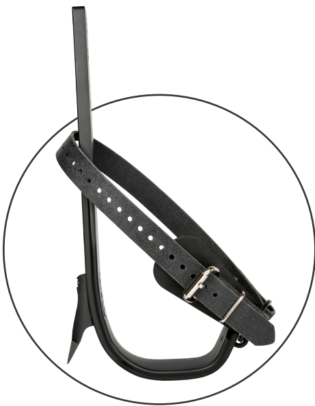
BuckAlloy™ Black Climber A94089A-BL

THE MOST DURABLE LIGHTWEIGHT CLIMBER IN THE INDUSTRY.